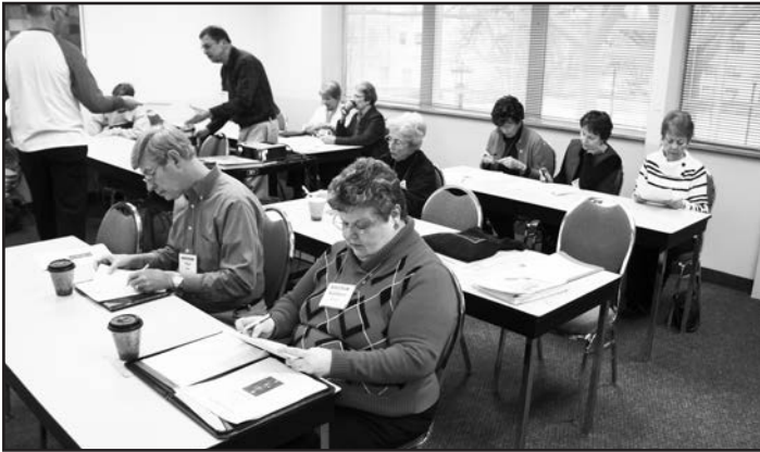
Filling out evaluations after each class is an important component of our lifelong learning program.

RI = Returning Instructor RC = Repeat Class NI = New Instructor NC = New Class