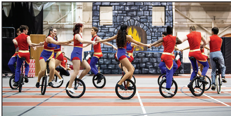
Gamma Phi Circus

$50 – includes guided tour, tasting, a catered lunch, and shuttle transportation.