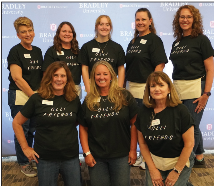
The Continuing Education team is going all in for Trivia 2025! All bets are on so don't miss the fun!

We've used your gifts to make capital investments, to expand our offerings, to continue programming during the pandemic, and to cover the costs of our signature quarterly catalog while keeping membership and program fees very affordable. This year, your generous gifts will fund the design, printing, and mailing of our catalogs, replace our aging headsets and microphones used on every learning trip, maintain our shuttles, replenish our shuttle replacement fund, and contribute to our operational emergency reserves.