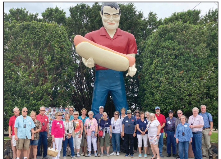
OLLI members take a bite out of roadside history in Atlanta.